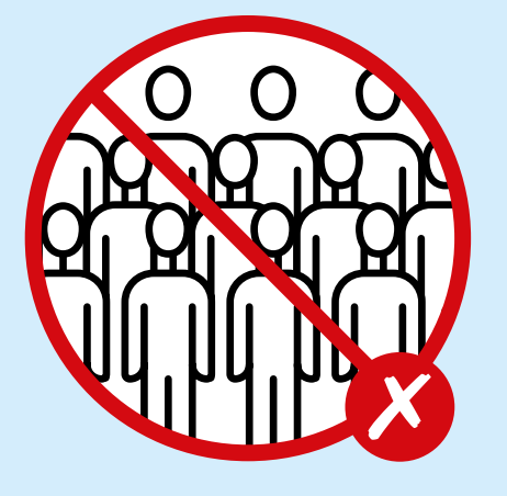
Avoid crowds of people.