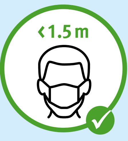
Wear mask if the protective distance is not reached.