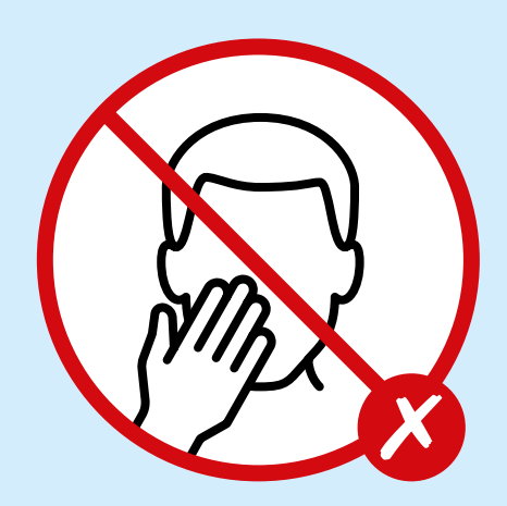
Do not touch your face with your hands.