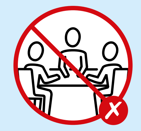
Avoid face-to-face meetings; alternatively, use telephone and video conferences.