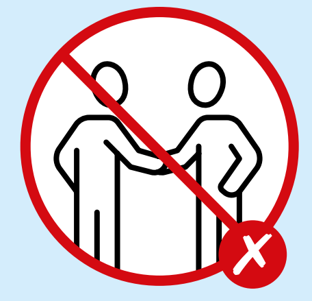
Do not shake hands.